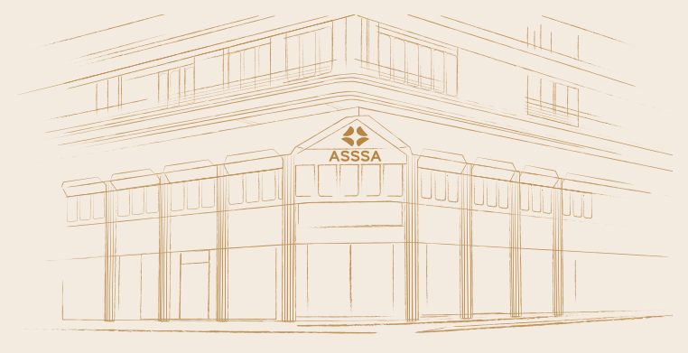
Tradition and innovation in Health