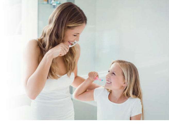
Life is better with a smile

Start saving and enjoy a comprehensive assistance in your language to achieve your best smile: